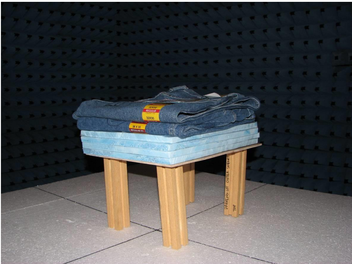
Figure 1: Single Inlay between Two Denim Articles

The inlay is measured when applied on the pocket flasher of a denim article with another untagged denim article placed on top of the tagged denim. Both the articles are placed on the testing platform as shown in Figure 1. The tagged denim article is placed on the platform such that the inlay is on the top. The face of the inlay will be parallel to the face of antenna 4.